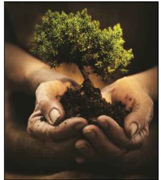
Lean Business Growth

The program is designed to give key leaders within your business the correct lean mindset, tools and experience to move forward on the journey toward operational and business excellence.